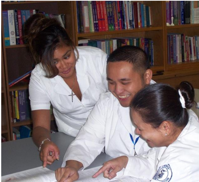
EXPERIENCE J' RENEÉ COLLEGE