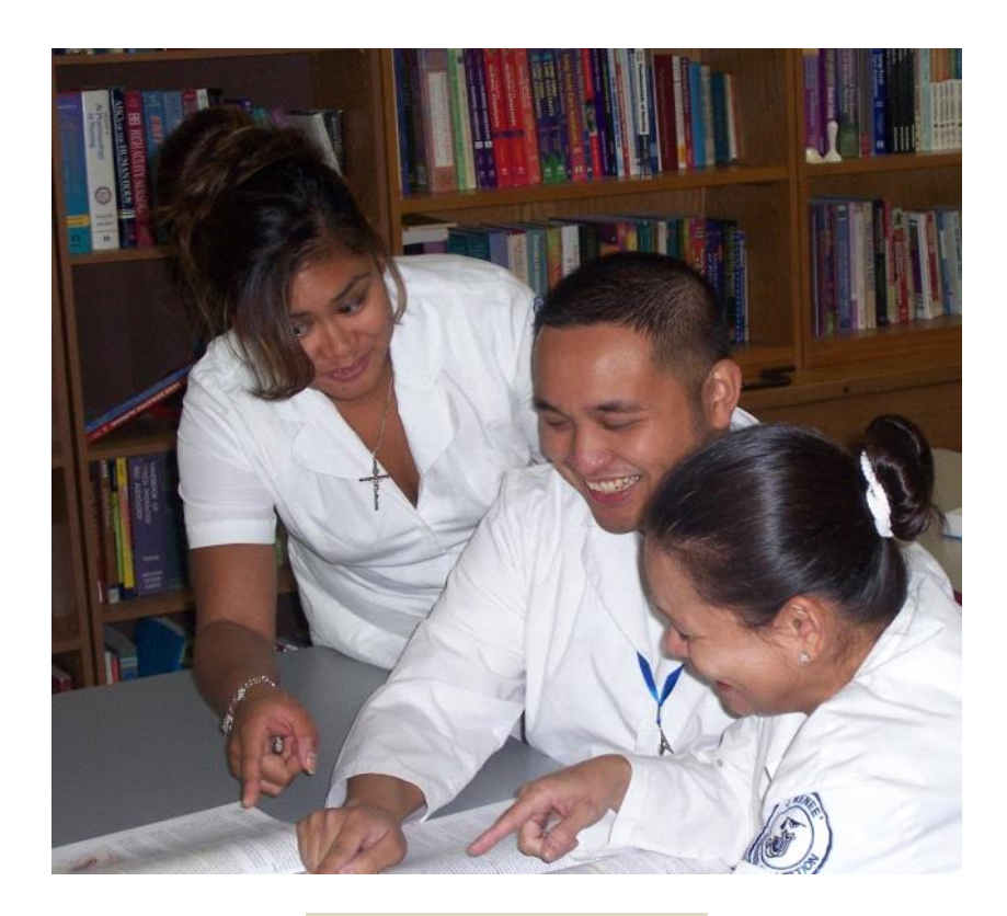
EXPERIENCE J'RENEÉ COLLEGE